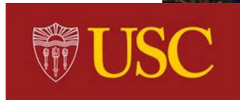
PHS Counseling Staff